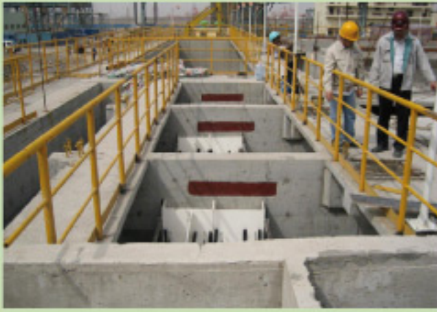
SHANGHAI: BAO STEEL CORP.