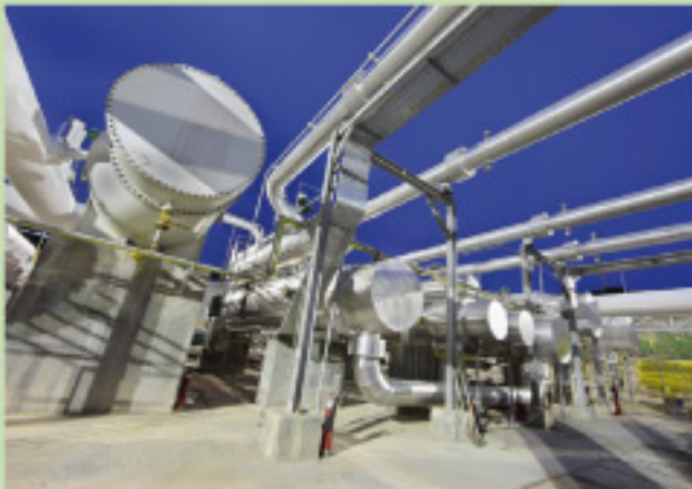
IRAQ: POWER PLANT