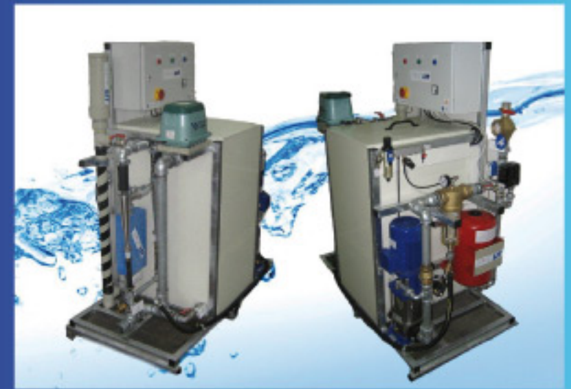
* ECOLIT 30 - 600 MF *