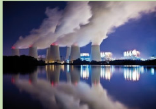
BOXBERG : POWER PLANT VATTENFALL