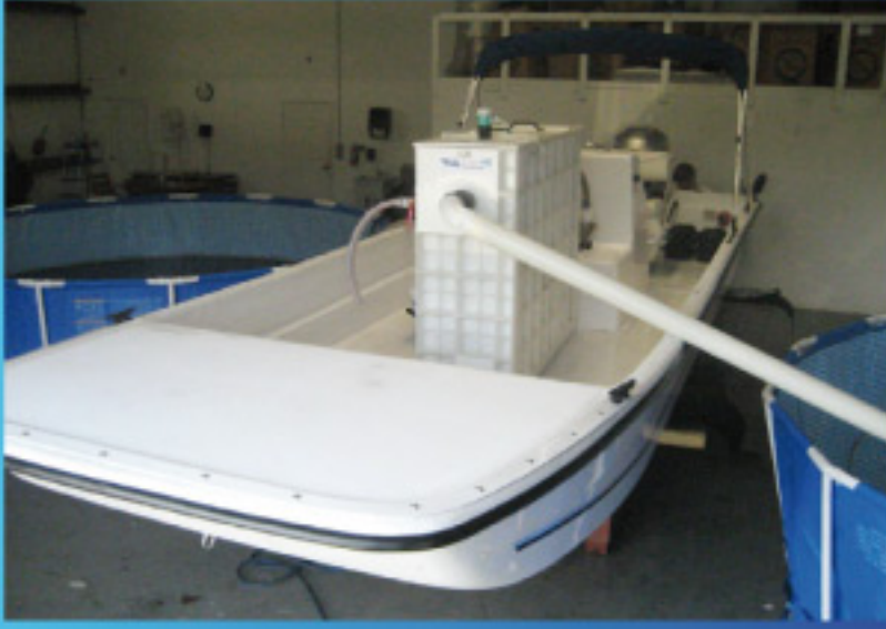
MOBILE OIL SPILL REMEDY