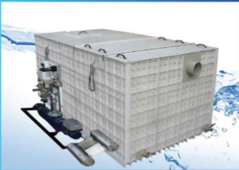
MOBILE OIL SEPARATOR