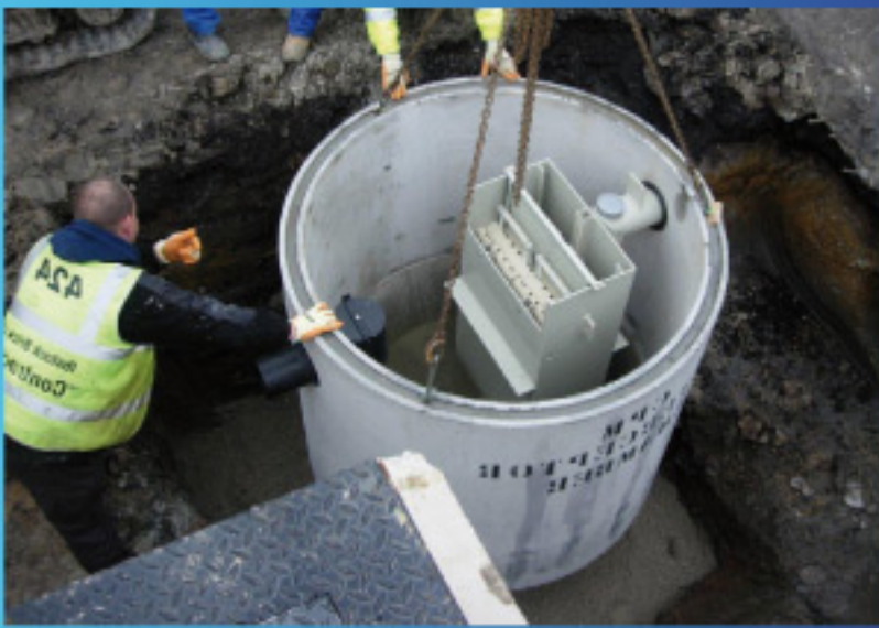
OIL SEPARATOR according to EN858