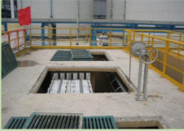
CHINA: DALIAN REFINERY

The most efficient water treatment systems