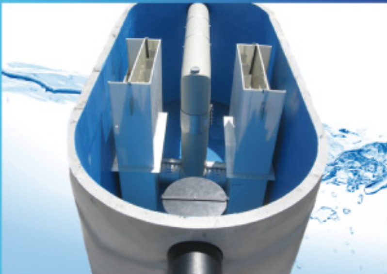
OIL SEPARATOR FOR TRAFFIC AREAS