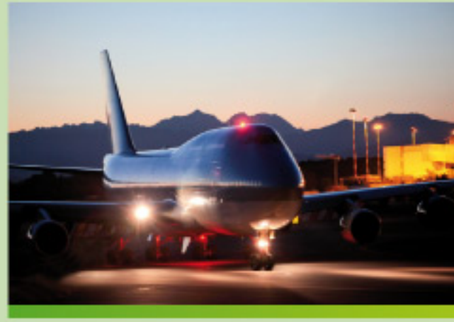
NORWAY: AIRPORT GARDAMOEN