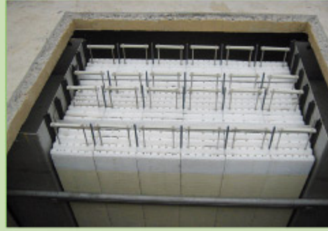
PAKISTAN: MANZALAI MOL