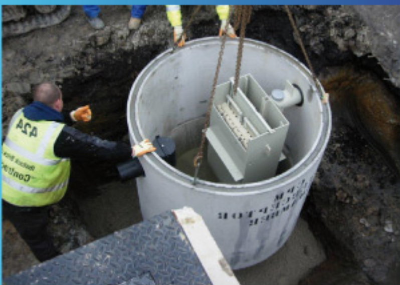
OIL SEPARATOR according to EN858