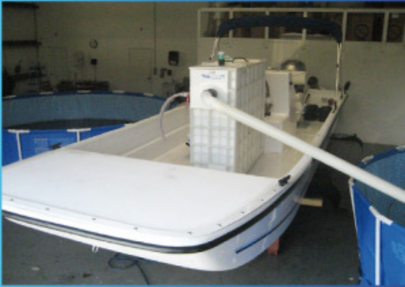
MOBILE OIL SPILL REMEDY